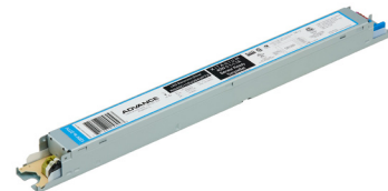
Advance Xitanium SR FlexTune LED driver