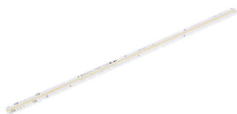
Fortimo LED strip PR LV5 FlexTune module